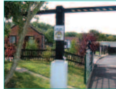
An Essex County Council site.

The key to a reduction in unauthorised camping is to increase the supply of authorised sites. The Government is committed to increasing site provision, linked to firm but fair use of enforcement powers against unauthorised sites and anti-social behaviour.